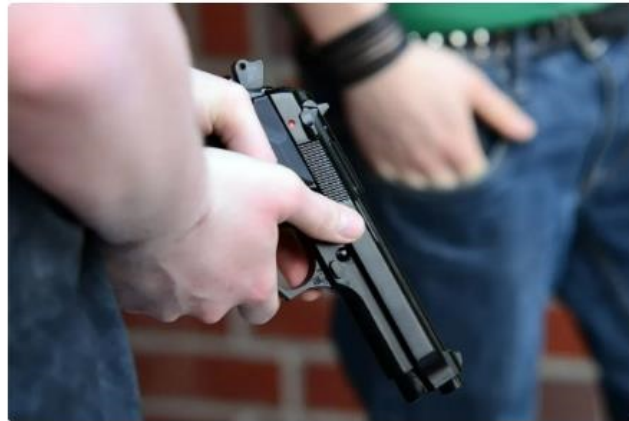
一對韓國夫婦在關島遇襲，丈夫遭槍殺身亡。

本月4日，度假勝地關島傳出一起槍擊案，一對韓國遊客夫婦在路上遭搶，50多歲的丈夫被槍殺，事件引發當地韓國社群譁然，稱這是史無前例的事件。