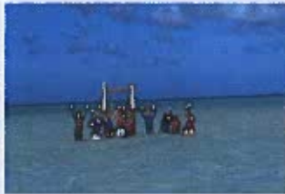
Bikini Island Club