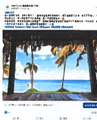
Facebook (Guam Scenery)

It's a wonderful time. No need to arrive early in the morning and drag your exhausted body around the city. It would be even better if the return time is later!