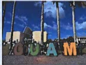
Guam Sign (Hagåtña)