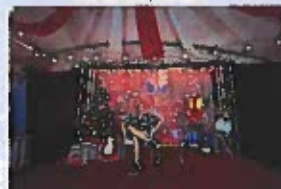
Site Inspection: Crowne Plaza Resort Guam