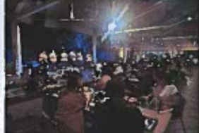
Site Inspection: Arlus Wedding - Crystal Chapel