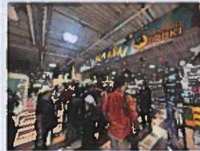
Tax-Free Shopping: Village of Donki