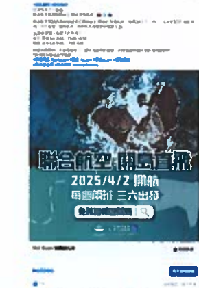
Facebook (UnitedAirlines Direct Flight Pro)