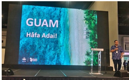
*MATTA Fair 2023

MATTA Fair is the largest travel consumer show in Malaysia attracting over 200,000 eager travelers in Kuala Lumpur and throughout the country. GVB will be working with trade partners to promote visa-free travel to Guam for Malaysians.