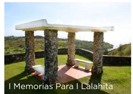
I Memorias Para I Lalahita

I Memorias Para I Lalahita - Dedicated in 1971 to the Guam men who died in Vietnam, this site offers an unmatched view of Guam's southern mountains. A 2-foot wall surrounding the memorial allows you to sit and admire waterfall valleys, mountain ranges, and Umatac village below.