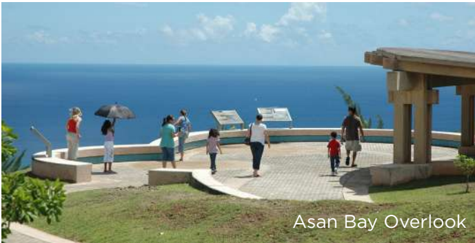
Asan Bay Overlook

South Pacific Memorial Park - To commemorate all those who died on Guam during World War II, a Japanese non-profit group called the South Pacific Memorial Association Mission funded construction of this memorial, completed in May 1970. Located just off Marine Corps Drive at the foot of Mt. Matagi, it is known as the last Japanese command post. A 50-foot tower shaped like praying hands commemorates 500,000 Japanese lives lost in Micronesia throughout WWII.