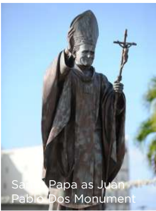
Santo Papa as Juan Pablo Dos Monument

Santo Papa as Juan Pablo Dos Monument - Across from Dulce Nombre de Maria Cathedral-Basilica in Hagåtña, a statue of Pope John Paul II commemorates the leader's first visit to the Marianas Islands in 1981. It rotates at a rate of one full revolution every 12 hours.