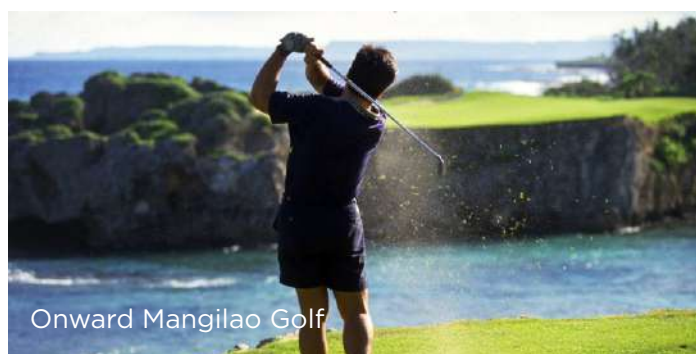
Onward Mangilao Golf

Golf: A round of golf in one of Guam's many courses is an opportunity well worth the effort. Seven courses ranging in environment and difficulty level are situated throughout the island, many of which were designed by golfing greats Jack Nicklaus and Arnold Palmer. A golf driving range, located close to Tumon (Guam's hotel district), is open until 10 p.m. Golf clubs, shoes, and other equipment may be rented at the pro shop. The island boasts top level golf courses - most with 18 holes - have pro and specialty golf shops at each respective clubhouse.