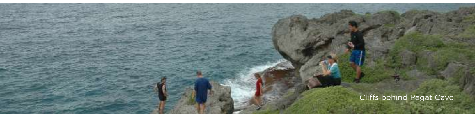
Cliffs behind Pagat Cave